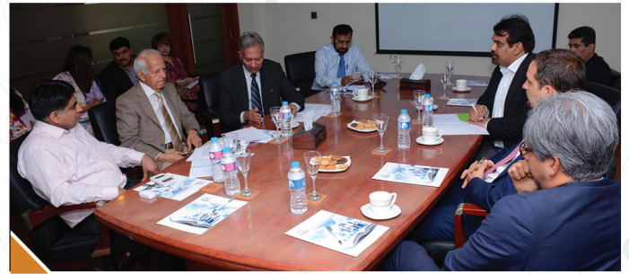
The team of LKPC in a consultative session with the delegates from King's College, London

Both parties deliberated in detail over the prospects of developing strategic partnership for knowledge transfer in Pakistan. It was discussed that management degree programs with specialization in entrepreneurship, e-commerce, data management, sustainable society, digital society, IT and health should be given priority to prepare the country's youth for 21st century.