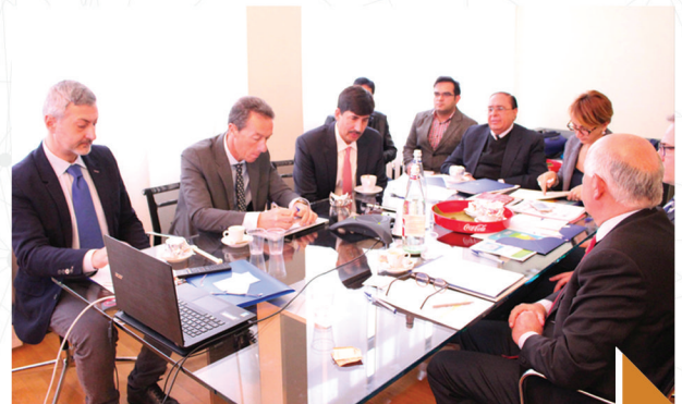
Towards establishing Pak-Italy University

Groupthink has been initiated with the reps of University of Cambridge, UK.