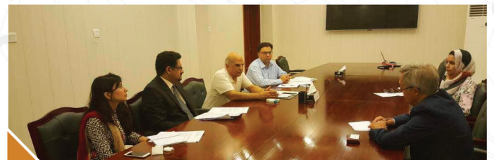
Meeting with French delegation at P&D Department, Lahore

LKPC held consultative sessions with the team of King's College Hospital, London to setup King's College Hospital (KCH), Punjab at Lahore Knowledge Park. Preliminary discussions involve establishment of a 250 bed teaching hospital in the first phase of project expanding to 750 beds in the second phase. Potentially, KCH, Punjab will be offering medical degree programs and clinical trainings accredited by Royal College of Surgeons & King's College Hospital London. The consultations were part of LKPC's plan to enable cutting-edge research in excellent patient care through the provision of world-class medical education and training. If materialized, KCH will certainly be a breakthrough in the area of clinical care in Pakistan, which is also a frontline development agenda of the provincial government.